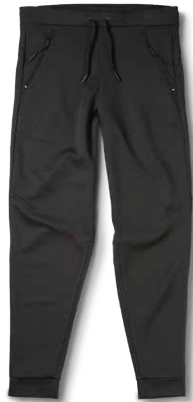
5606 Unisex Pants